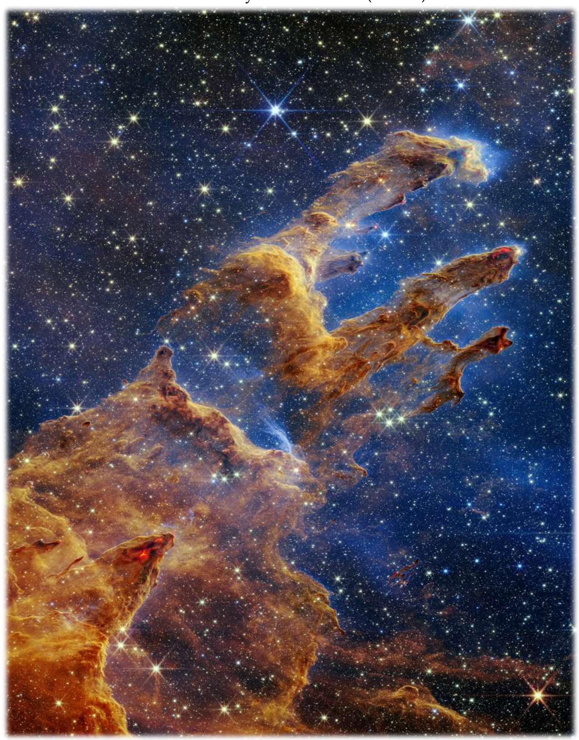
5<sup>th</sup> Sunday After Epiphany